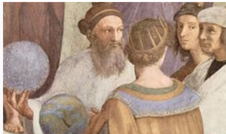
Detail of The School of Athens by Raphael, 1509, showing Zoroaster (left, with star-studded globe).

In the Gathas , Zoroaster sees the human condition as the mental struggle between aša (truth) and druj (lie). The cardinal concept of aša —which is highly nuanced and only vaguely translatable—is at the foundation of all Zoroastrian doctrine, including that of Ahura Mazda (who is aša ), creation (that is aša ), and existence (that is aša ) and as the condition for Free Will. The purpose of humankind, like that of all other creation, is to sustain aša . For humankind, this occurs through active participation in life and the exercise of constructive thoughts, words and deeds. Elements of Zoroastrian philosophy entered the West through their influence on Judaism and Middle Platonism and have been identified as one of the key early events in the development of philosophy. Among the classic Greek philosophers, Heraclitus is often referred to as inspired by Zoroaster's thinking. Zoroaster emphasized the freedom of the individual to choose right or wrong and individual responsibility for one's deeds. This personal choice to accept aša or arta (the divine order), and shun druj (ignorance and