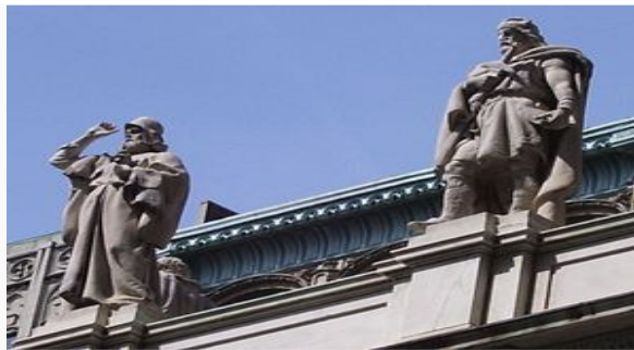
Zoroaster (left) standing over the First Judicial Department of The New York Supreme Court.

Zoroaster was mentioned by the Irish poet William Butler Yeats . He and his wife were said to have claimed to have contacted Zoroaster through " automatic writing ".