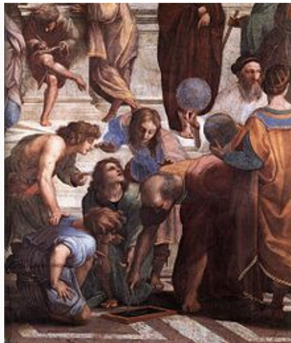
Zoroaster holds the celestial sphere in Raphael's School of Athens

The Gathas contain allusions to personal events, such as Zoroaster's triumph over obstacles imposed by competing priests and the ruling class. They also indicate he had difficulty spreading his teachings, and was even treated with ill-will in his mother's hometown. They also describe familiar events such as the marriage of his daughter, at which Zoroaster presided. In the texts of the Younger Avesta (composed many centuries after the Gathas ), Zoroaster is depicted wrestling with the daevas and is tempted by Angra Mainyu to renounce his thinking. The Spend Nask , the 13th section of the Avesta , is said to have a description of the prophet's life. However, this text has been lost over the centuries, and it survives only as a summary in the seventh book of the 9th-century Dēnkard . Other 9th- to 12th-century stories of Zoroaster, such as the Shāhnāmeḥ , are also assumed to be based on earlier texts, but must be considered as primarily a collection of legends . The historical Zoroaster, however, eludes categorization as a legendary character.