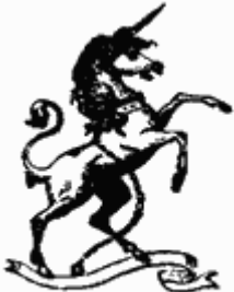
Unicorn, in British Royal Coat of Arms.

TRIDENT: Called "the devil's pitchfork," it has symbolized major gods in various pagan cultures. In India, it is linked to the Hindu "trident-bearer" Shiva, spouse of the skull-bearing goddess Kali.